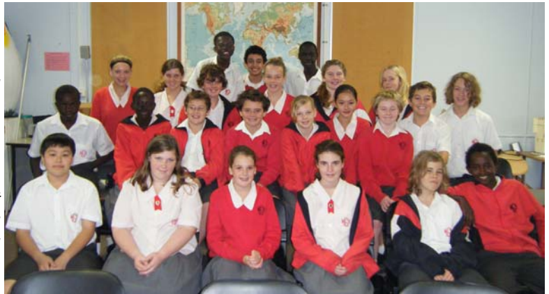
Year 8 SOSE class