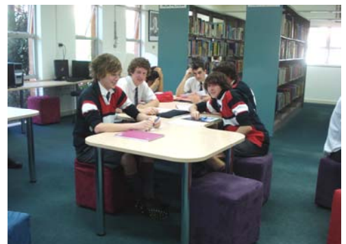
Year 12s working in the Resource Centre

This week sees the beginning of the Year 10 subject selection process for Year 11 subjects in 2010. I urge all Year 10 students in consultation with parents/caregivers to make informed decisions based on the most appropriate information. Good decisions are based on accurate information.