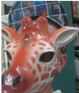
Book Safari Giraffe

Readers' Cup involves students in competition at the regional and state level that is similar to those conducted in the sporting arena, and allows them to meet other students with an equal passion for books. All teams participated in an enthusiastic and cooperative manner in front of an audience of parents and teachers.