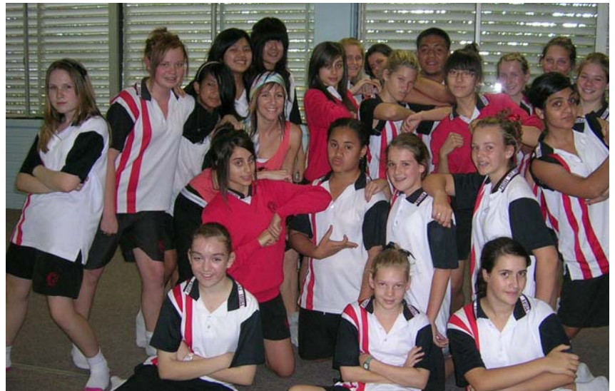
Hip Hop Dance with Raw Dance Company