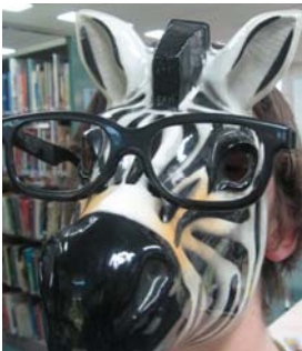
Book Safari Zebra