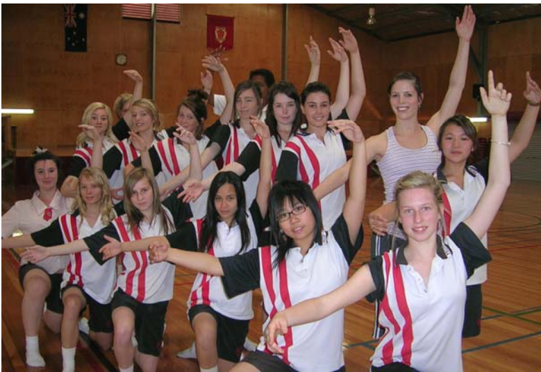
Year 10 Dance students with Expressions Dance Company

Instrumental Music Camp 2009 – Congratulations to all the Instrumental Music students who are currently attending the Sunshine Coast camp from 14-16 October.