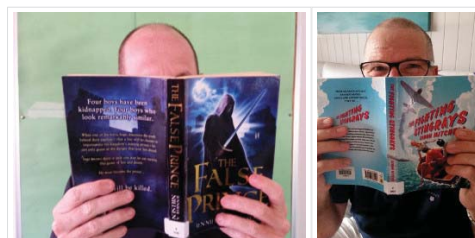
Reviews of new reads